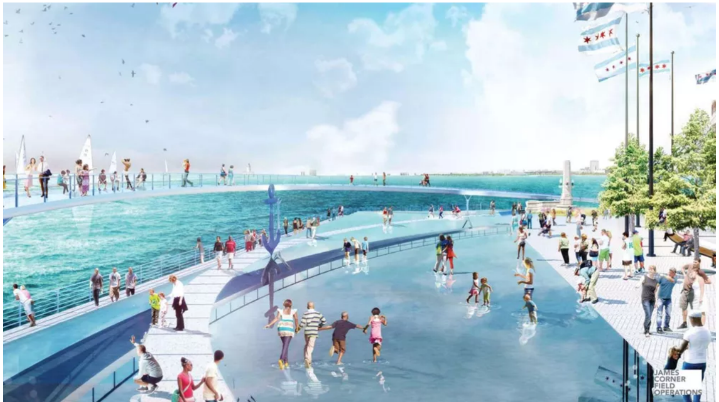
The so-called "Lake Overview" pathway and reflecting pool.

visitors to get even closer to the lake. The addition comes from James Corner Field Operations, the architect behind New York's High Line linear park. Work on this phase of improvements has yet to begin.