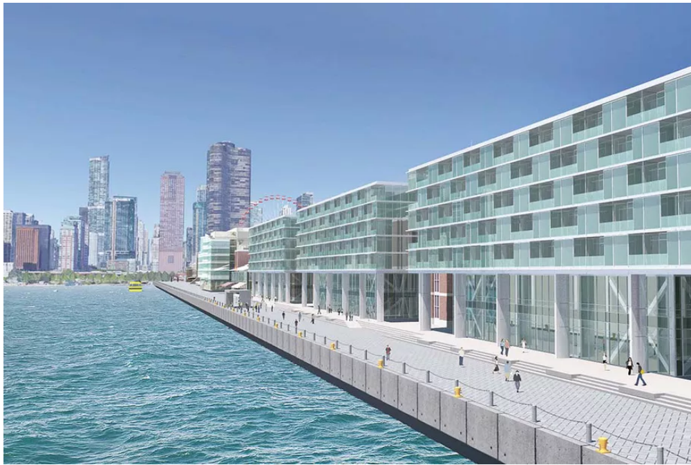
The new seven-story hotel structure will be comprised of five floors of guest rooms above the two levels of revamped dining and entertainment space. | KOOL LLC

Just weeks after opening a new, reconfigurable performance space for the Chicago Shakespeare Theater, Navy Pier is ready to begin the next—and perhaps most dramatic—phase of renovations: construction of a 222-room waterside hotel . Thanks to a newly