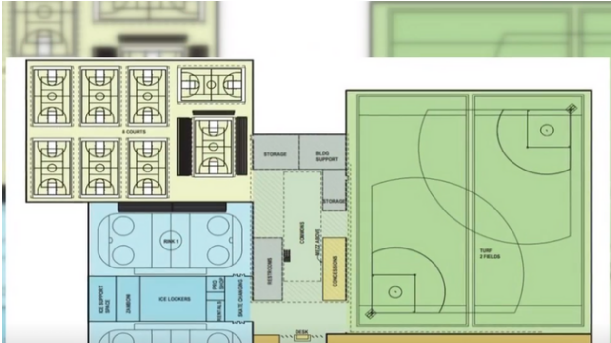
A rendering of the Mishawaka sports complex that is expected to be completed in Spring of 2024. (Photo provided)

MISHAWAKA, Ind. (WSBT) — A proposed Mishawaka sports complex has cleared a major funding hurdle.